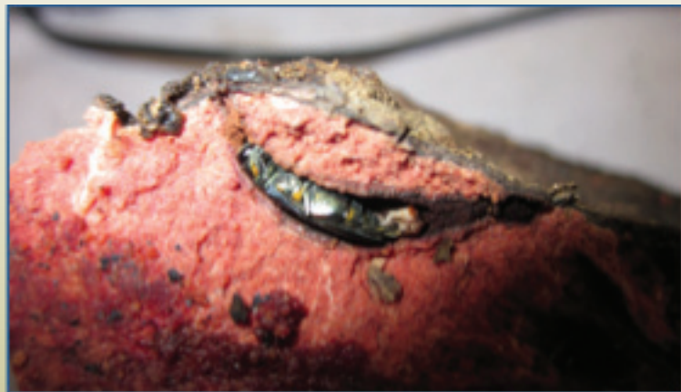
Left: GSOB larva preparing a pupation chamber near the outer bark.