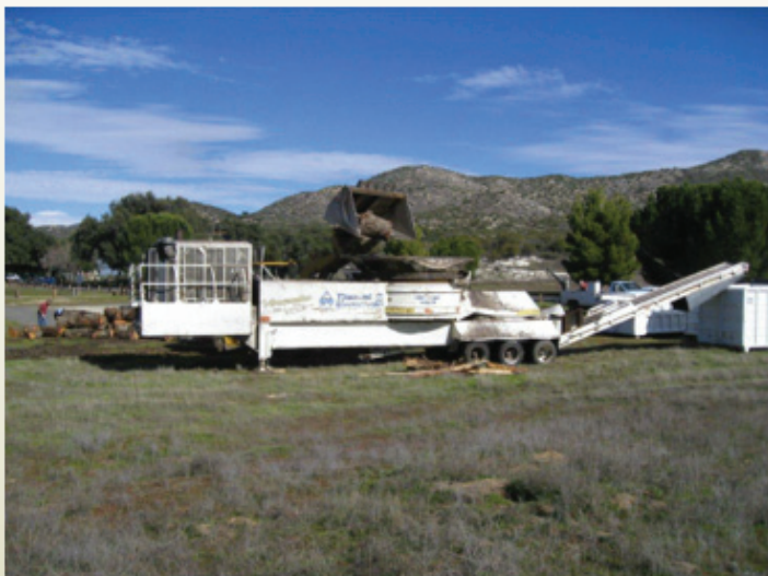
Commercial-sized tub grinders may be required to handle large pieces of oak.

Heat treatment of infested wood material at 160°F for a minimum of 75 minutes in an automated wood-drying kiln has been shown to eliminate many insects and diseases from firewood. These kilns have the capability of measuring and recording temperature time and duration well inside a pile of wood. However, no scientific study has been conducted to confirm that this temperature and time standard will kill GSOB.