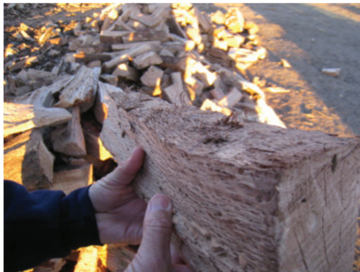
Debarked coast live oak firewood

Oak firewood that is free of bark will not transport GSOB. However, debarking can be very difficult to accomplish on “green” wood from recently killed trees; bark tends to come off the wood more easily over time as it dries out. If you choose the debarking option, make sure that the bark is stripped off all the way to the sapwood and not just the outer layer of bark is removed. Season, destroy or carefully dispose of the removed bark because it can still harbor borer larvae. Bark can be enclosed within plastic tarp, plastic bags or fine mesh window screen to allow it to season for two years. Make sure there are no seams or holes that would allow the beetles to escape.